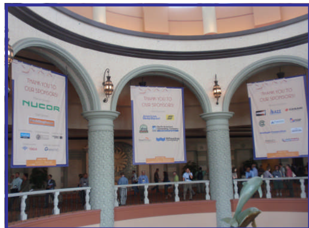
Sponsorship banners hang in the lobby of the Gaylord Palms Convention Center.